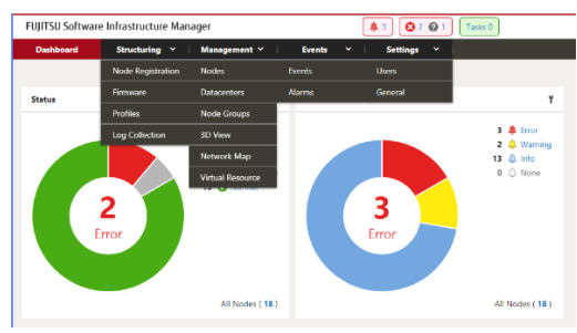
Fig: ISM Advanced dashboard View

It is a full-featured advanced version of ISM that provides comprehensive and robust infrastructure management capabilities across servers, storage, and network devices. With centralized management of entire data centres, companies can pave their path to achieving Software-defined data centre. Some of the advanced capabilities include a unified and intuitive dashboard, firmware baseline management to ensure hardware compliance, automated deployment of all nodes with profile management. It also monitors 3rd party vendor devices in addition to integrating into VMware®, Microsoft® System Center®, and Ansible environments.