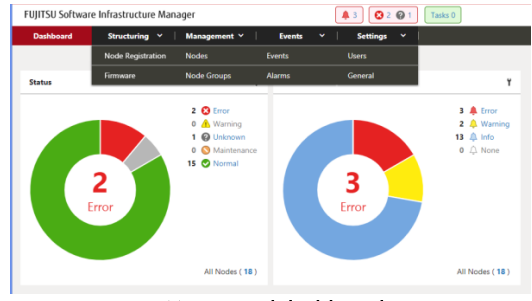
Fig: ISM Essential dashboard view

It is the standard version of ISM and serves as the entry point to infrastructure management. It provides essential monitoring capabilities and update functions across all supported devices including storage and network switches. It also provides health monitoring, inventory management, event management functions etc. It is available free-of-charge, but optional support pack is available at an additional cost.